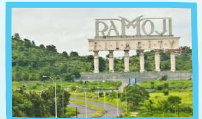
Ramoji Film City