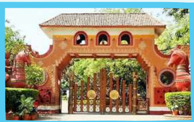
Shilparamam Art & Craft Village