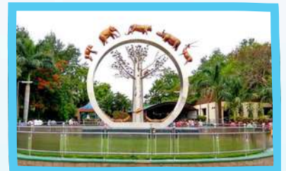
Nehru Zoological Park